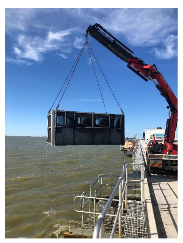
Figure 1: Fishway trap being pulled from the trapezoidal fishway at Tauwitchere barrage for fishway monitoring in August 2020 (Lake Alexandrina side of the barrage)